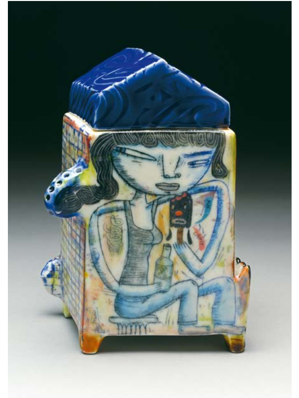
Datz Dope Box (two views), 2014, porcelain, glazes, underglaze, and oxide wash, 8.5 x 6 x 4.5 inches