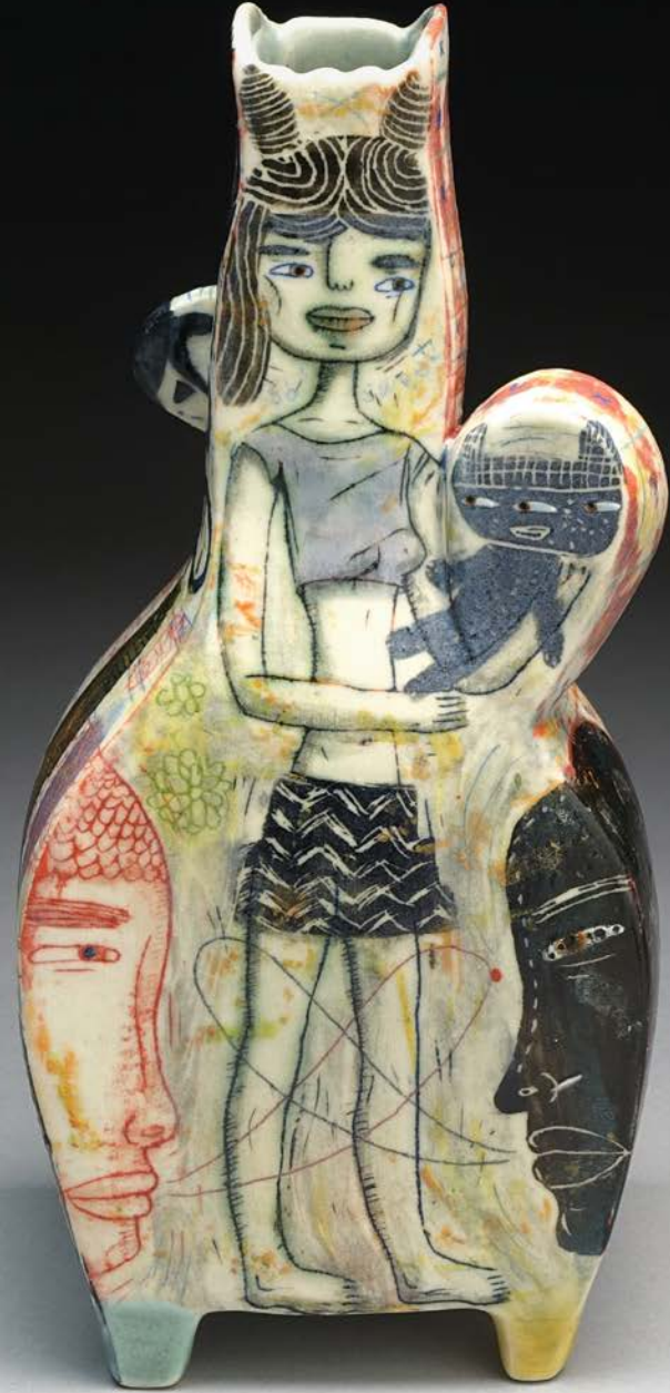
Little Friend (two views), 2015, porcelain, glazes, underglaze, and oxide wash, 9 x 4 x 3 inches