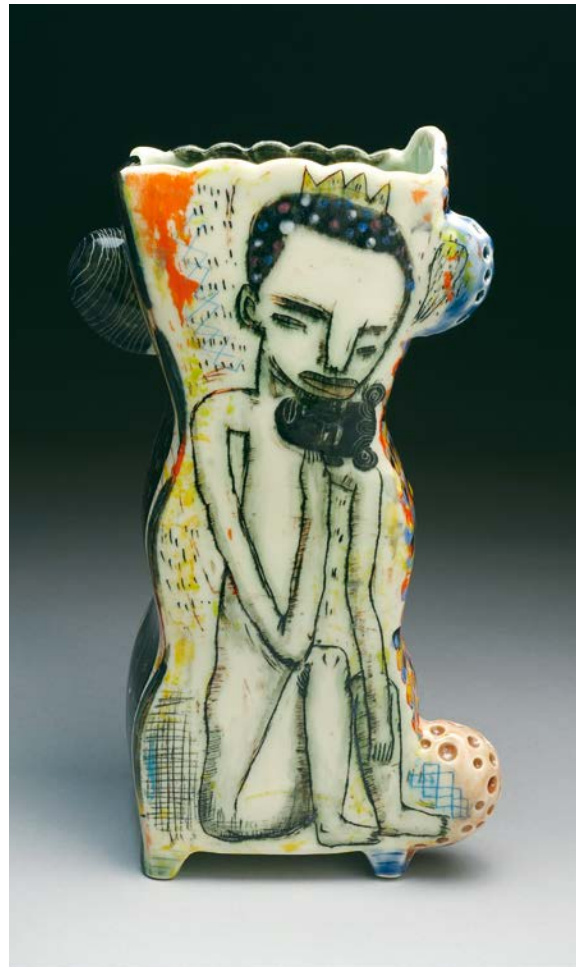
Crown (two views), 2014, porcelain, glazes, underglaze, and oxide wash, 11 x 6 x 4 inches