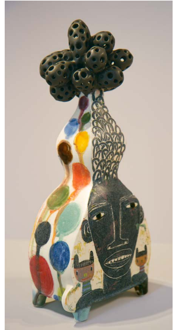
Braids (two views), 2015, porcelain, glazes, underglaze, and oxide wash, 14 x 6.5 x 3.5 inches. Right: Photo by Andrea Packard