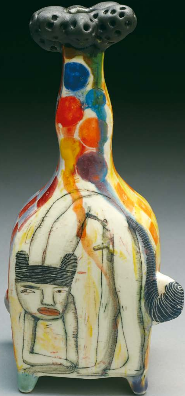
Animal , 2015, porcelain, glazes, underglaze, and oxide wash, 9 x 4 x 3 inches