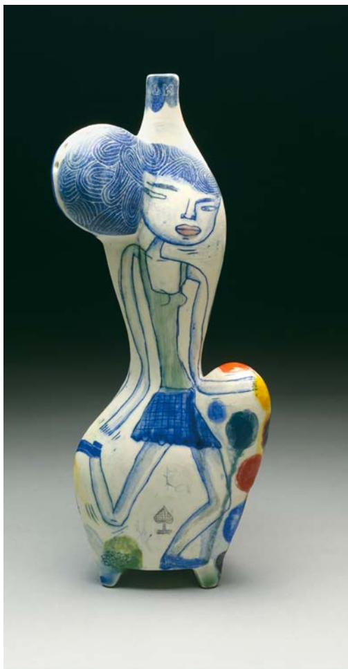
Three Girls (three views), 2015, porcelain, glazes, underglaze, and oxide wash, 12 x 6 x 5 inches