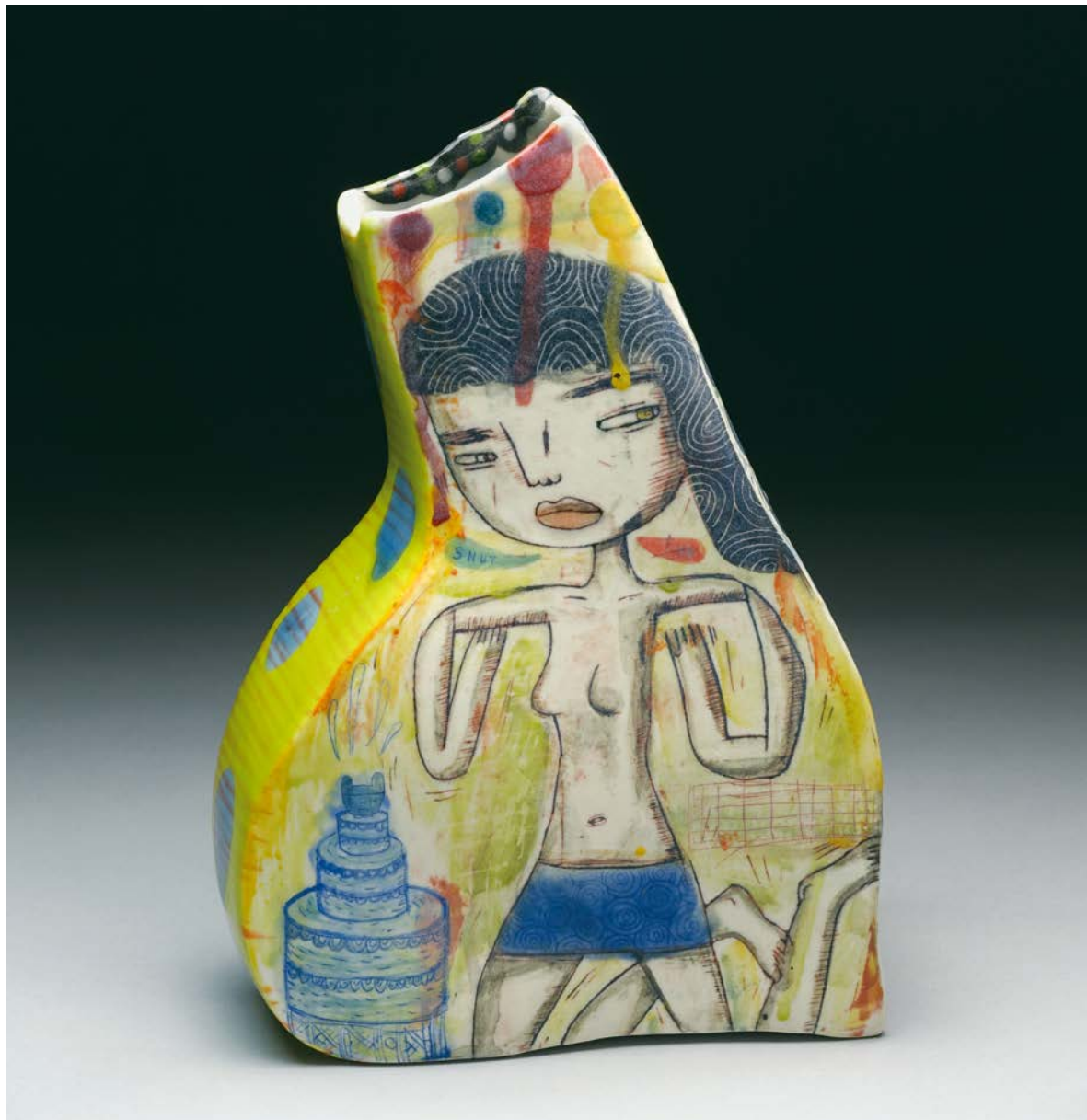
Birthday Cake (two views), 2015, porcelain, glazes, underglaze, and oxide wash, 10.5 x 7.5 x 4.5 inches