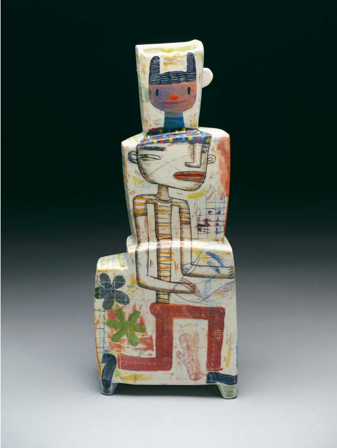
Stack , 2015, porcelain, glazes, underglaze, and oxide wash, 13 x 5 x 3 inches