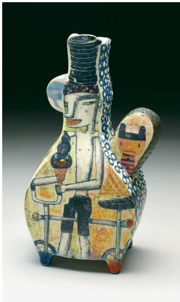
Triple Decker (two views), 2015, porcelain, glazes, underglaze, and oxide wash, 9 x 5 x 3 inches