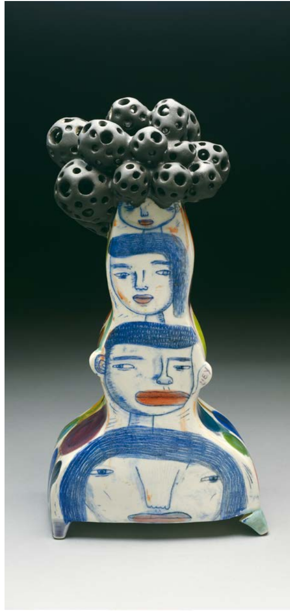
Peanut Gallery (two views), 2015, porcelain, glazes, underglaze, and oxide wash, 13.5 x 6.5 x 4 inches