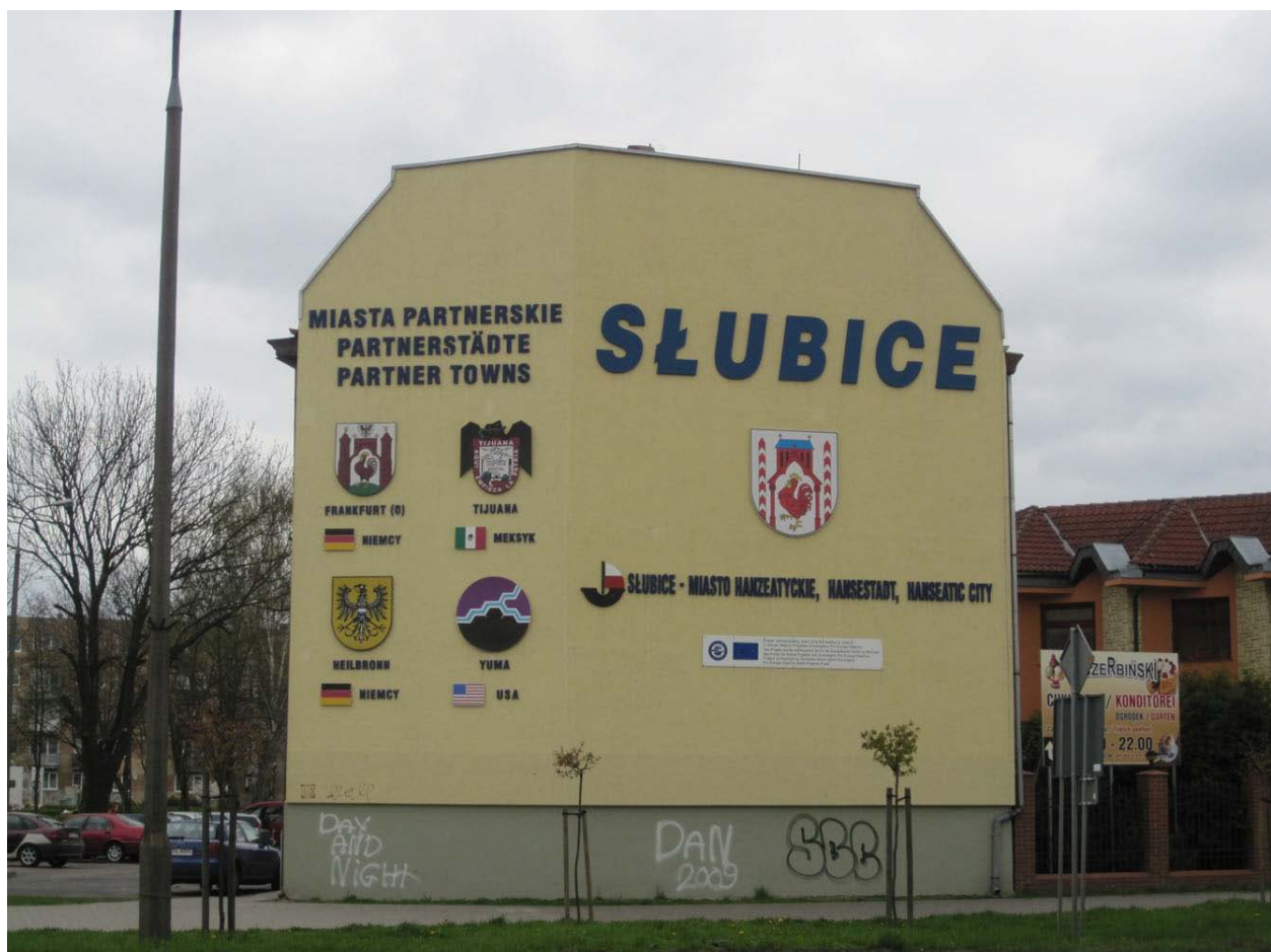
Figure 4.1. Display of Słubice’s partner towns as seen near the city center (Clark, 2010).

signs mostly in German, some in Polish, advertising prices for cigarettes and conversion rates for exchange bureaus (marked as both a “Kantor” (in Polish) and a “Wechselstube” (in German)). Biedronka, one of the grocery stores in Słubice, posts a sign outside of its front doors stating in Polish, German, and English that, as Poland is now part of the European Union, the store accepts (out of obligation) both Złoty and Euros. There is also a building whose side faces the bridge and Zigarettenstraße in Słubice which advertises Słubice's connections outside of Poland, displaying the names and shields of its partner cities throughout the world in Polish, German, and English.