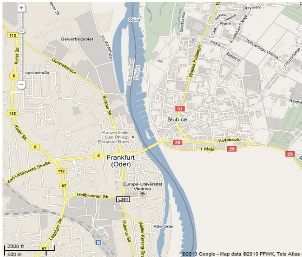
Figure 1.2. Frankfurt an der Oder and Słubice in relation to each other along the river Odra.