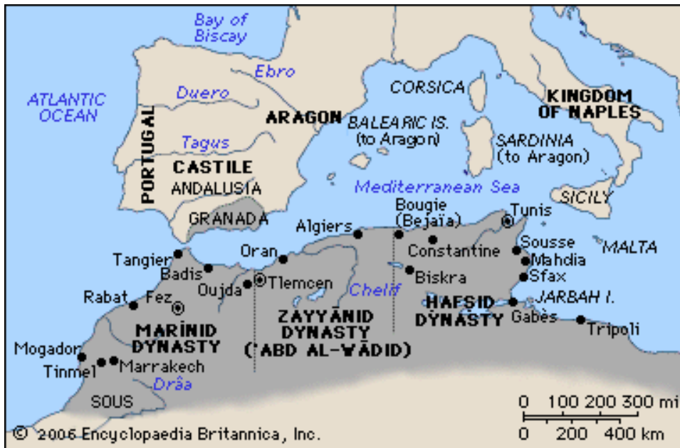
Figure 3: Amazigh dynasties of North Africa, 13th–14th century

However, Berbers also recognize proudly the greatness of early Berber Moroccan dynasties: the Almoravids (1056-1147), the Almohads (1130-1269), and the Marinids (1196-1464). Famous names in history such as Tertarus, Saint Augustin, and Abdelkarim Al Kahttabi also form part of a proud Berber heritage.