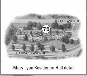
Mary Lyon Residence Hall detail